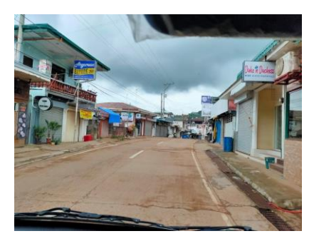
This street is usually packed with motorbikes, tricycles, cars & vans!

During August it was reported that there was local transmission of Covid on Coron. The officials initially locked down a specific area of town where cases were, however, as the weeks progressed the cases continued to rise and spread to other areas of Coron. Unfortunately, there has also been 2 deaths.